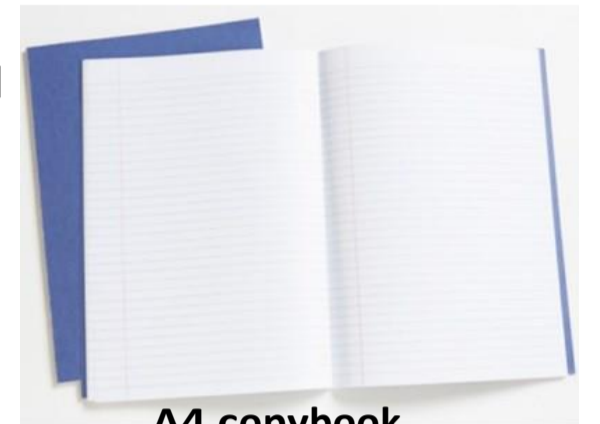
A4 copybook both sides lined