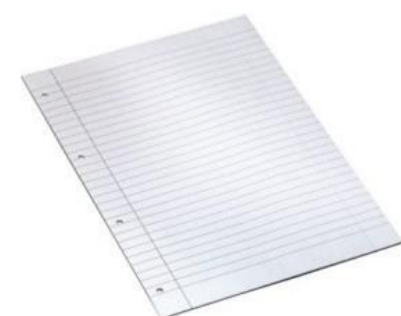
A4 refill pad

1 yellow, 1 green, 1 orange highlighters