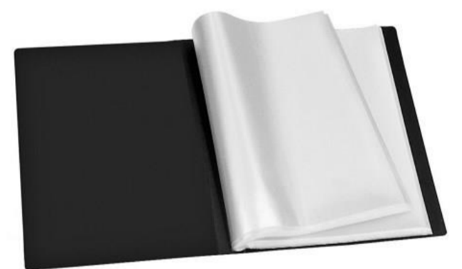
Display folder plastic pockets inside