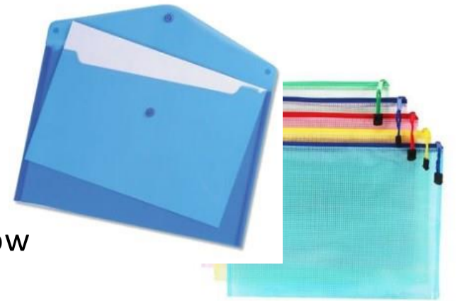
A4 pocket folder OR A4 mesh zipper

In all they would be needing 4:- 1 red, 1 blue, 1 green and 1 yellow