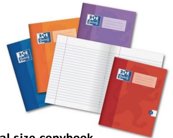
normal size copybook