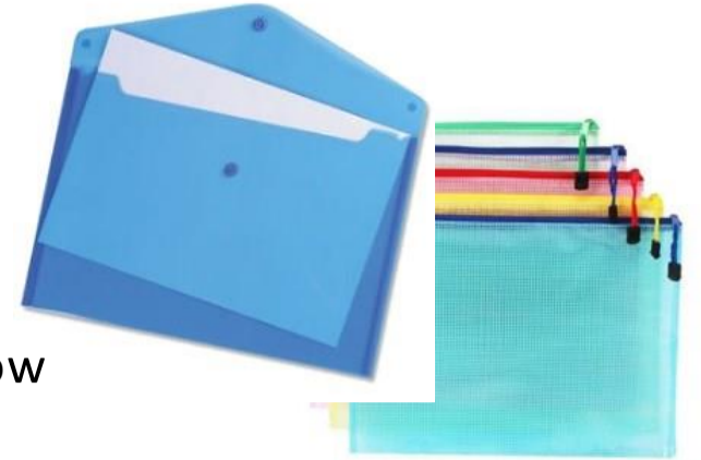
A4 pocket folder OR A4 mesh zipper

In all they would be needing 4:- 1 red, 1 blue, 1 green and 1 yellow