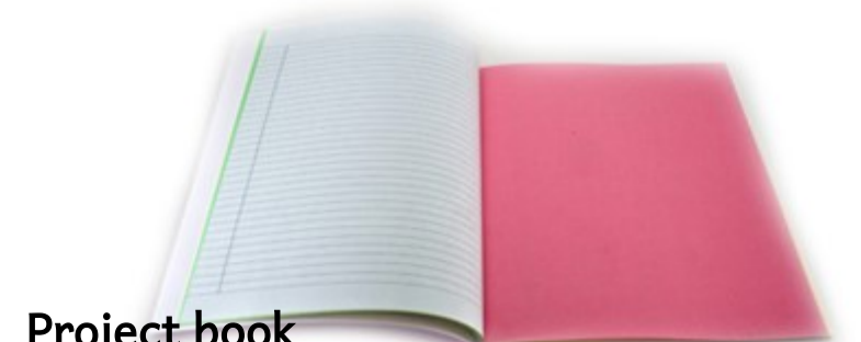
Project book one side lined — one side card