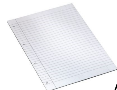
A4 refill pad