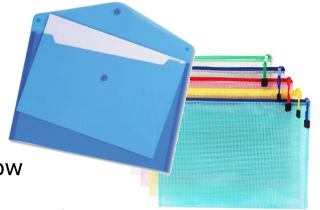
A4 pocket folder OR A4 mesh zipper

In all they would be needing 4:- 1 red, 1 blue, 1 green and 1 yellow