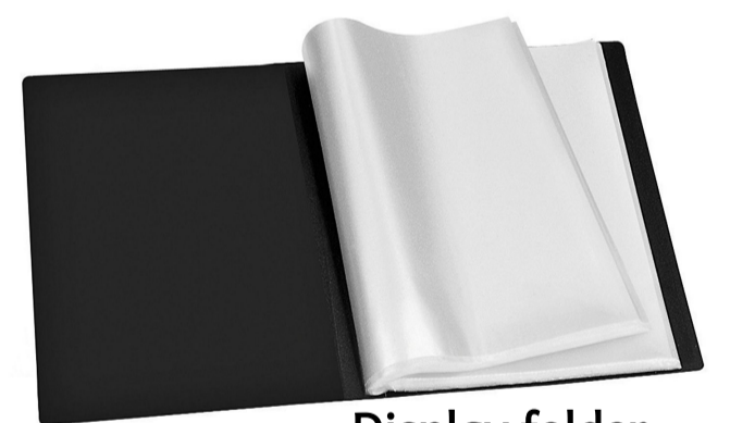
Display folder plastic pockets inside