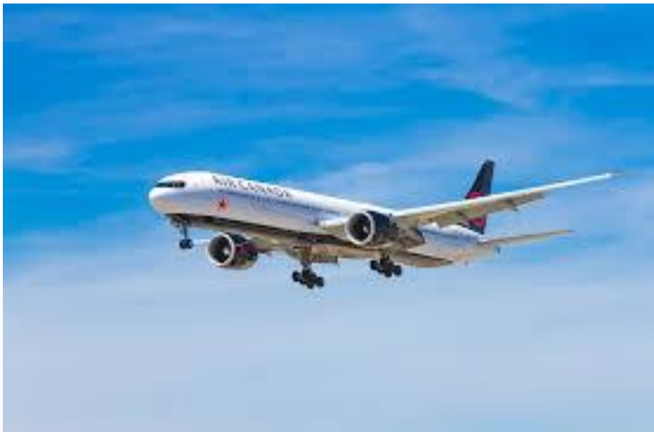
Air resistance force