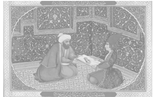
Queen Sheherazade narrating the stories to the king.

The Book One Thousand and One Nights is a collection of stories mainly coming from Arabia and Persia. However there are a few stories coming from India, Central Asia and China. All these stories were later collected together. The main story is about Queen Scheherazade who needed to entertain her husband, King Sheheryar or she would be put to death.